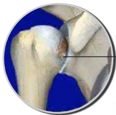
SHOULDER BEFORE PROCEDURE